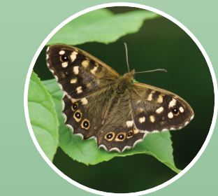
Speckled wood butterfly