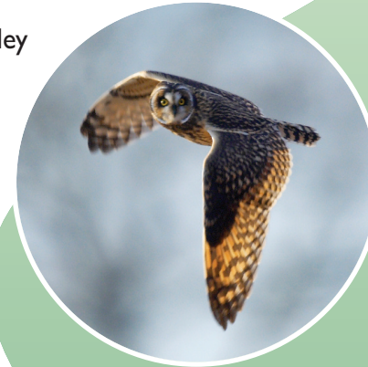
Short eared owl