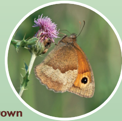
Meadow brown butterfly