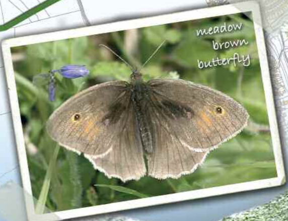
meadow brown butterfly