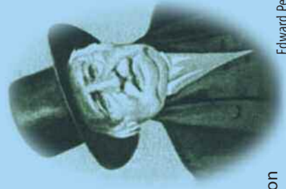
Edward Pease (Railway pioneer) 1767 - 1858

The first rails were laid in 1822. The railway opened officially on the 27th September 1825:- between 7am & 8am, 12 wagons of coal left the Phoenix Pit, near the end of the line at Witton Park Colliery. The wagons were hauled up Etherley North Incline by a stationary engine and then descended to St Helens. A further wagon loaded with sacks of flour was added to the train, which was hauled up the Brussleton Incline and then lowered to Shildon. At Shildon, the wagons were attached to Stephenson's Locomotion and tender along with 1 wagon carrying surveyors and engineers, a coach with directors of the Stockton & Darlington railway (with invited guests), 6 wagons of strangers, 14 wagons carrying workmen and 6 more wagons of coal.