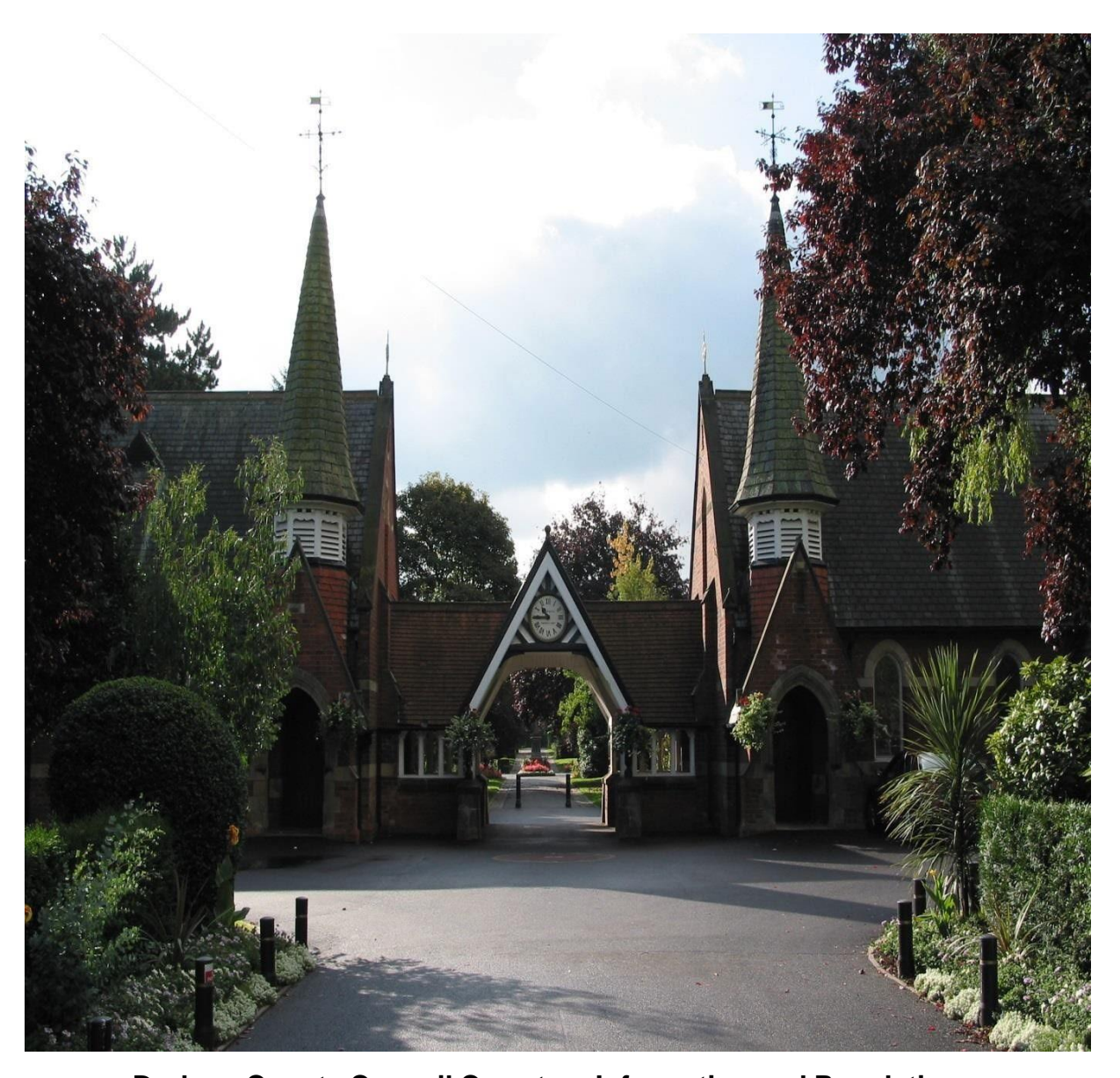
Durham County Council Cemetery Information and Regulations