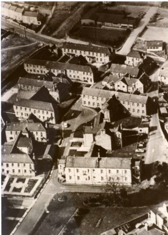
Aerial view of workhouse

Major changes in industry from the 18th century through to the early 20th century impacted on the landscape and the communities living there. The extraction of coal in the east of the Parish, quarrying, the construction of railways, brick, iron and coke works were all significant in this. Evidence of this industry survives in places, most notably in the reused lines of waggon-ways and railways that are now enjoyed for recreation. Malton, Hurbuck and Hollinside were home to mining communities.