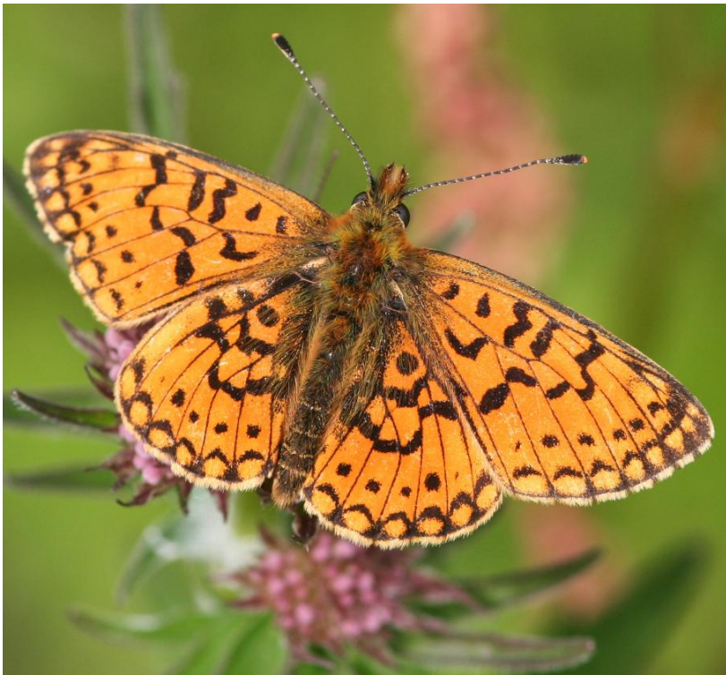
Small Pearl Bordered Fritillary Butterfly (Stuart Priestley)

There is little remaining ancient woodland apart from Deanery Wood, Loves Wood and tracts at Malton. Smaller pockets can be found but these are not recorded. A significant contribution to wildlife habitat is provided along the wide verges of roads in the west of the parish which were created during the enclosure acts. Brownfield sites also present good habitat opportunities and the nature reserve at Malton on old colliery land is particularly attractive to many species. Natural heritage is constantly evolving and requires adequate consideration and resources if this asset is to withstand further erosion.