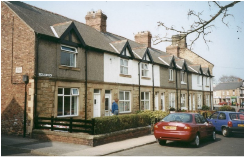
Conservation Area housing

The essential character of Front Street and the main core of the village is set by the simple two storey, gabled local sand-stone buildings dating from the 19th Century and earlier.