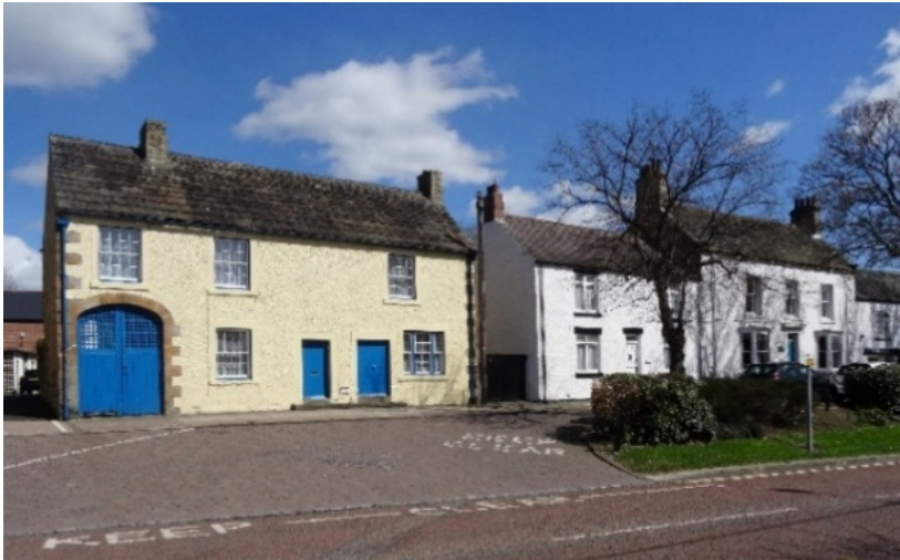
Old houses in centre of village

In the 16th century, Lanchester had a small population farming the land, grazing stock on the hilltops and fells to the west of the parish, and coppicing hazel for the coal industry. Little survives in the village or landscape today to shed light on this period.