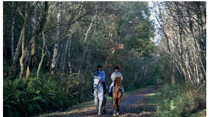
Lanchester Valley Walk

There is also an extensive well-used network of footpaths around Lanchester allowing access into the wider countryside. Several are documented in the Heritage Walks Leaflets published in 2012.