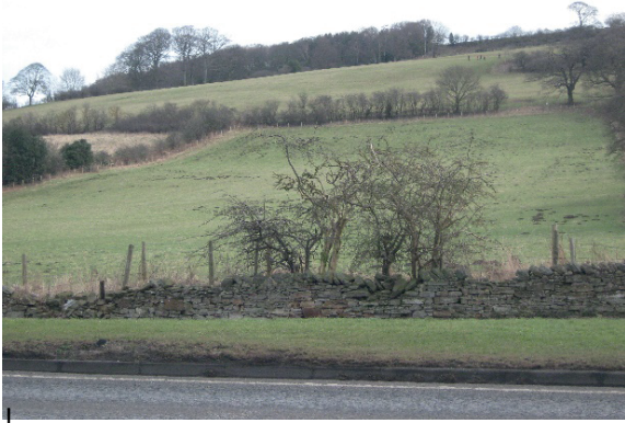
By-pass with open countryside

The A691 was re-routed in 1970 to by-pass the village centre and reduce the volume of traffic along the historic Front Street, protecting the old village from through traffic.