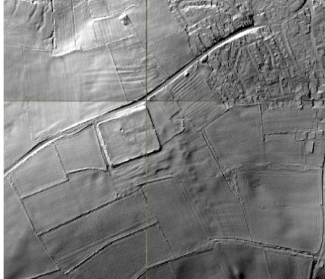
LIDAR image (Light Imaging Detection And Ranging)