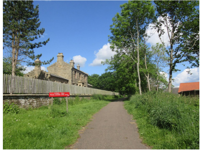
Station House today

During this flourishing period, several significant men and women lived in Lanchester: