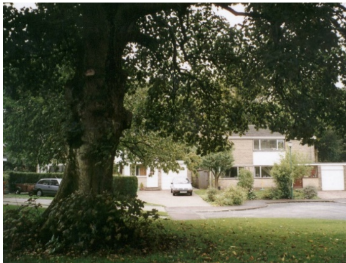
Deanery View estate

Estate development since the late 1940s, consisting of detached and semi-detached houses and bungalows, mainly of uniform appearance, breaks with traditional village design. The extensive use of standard designs of brick with concrete roof tiles, taken from builders' 'pattern books', with bargeboards, fascias and departures from traditional proportions has added to the mix of architectural styles. Most estate development is hidden behind traditional frontages and is not highly visible from within the village framework.