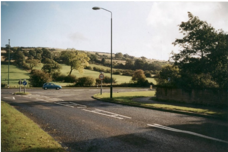
Hillside to north of EP School

At either end of Front Street, Church View and Croft View provide strong lines of buildings overlooking important open areas: the Village Green and the Lanchester Endowed Parochial school grounds with the open hillside beyond.