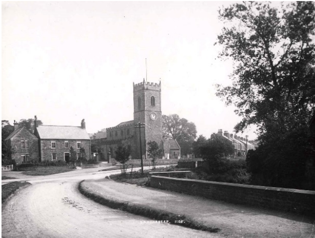
Before and after the by pass

The 20th century left its mark on Lanchester, with a decline of industrial activities in the Parish followed by a flurry of opencast and strip mining in the middle of the century. Coal was extracted and land reinstatement followed, causing a loss of historic landscape. Other reminders of the last century can be seen on a number of memorials to those who served in the two world wars and other conflicts, and in abandoned military structures and prisoner of war camps. Within the village itself sections of the Smallhope and Alderdene Burns were culverted, new housing constructed, and the population grew significantly before dipping slightly. The railway closed and the bypass was constructed in 1970.