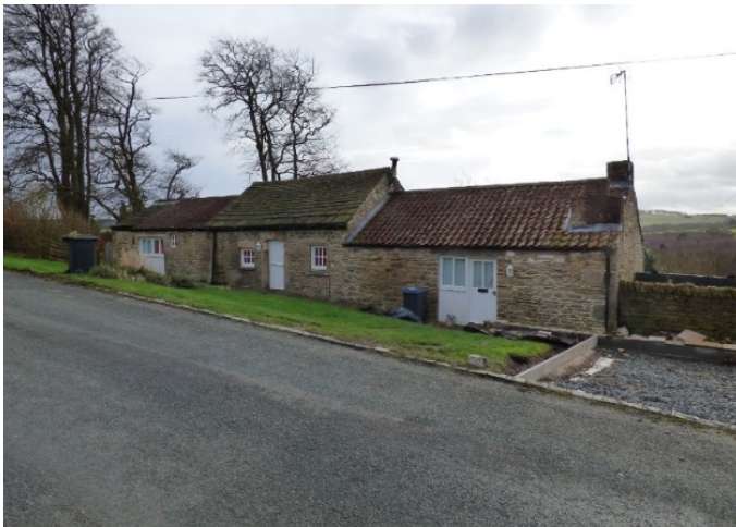
Smithy at Five Lane Ends

As in many areas of County Durham, the farm steadings were largely rebuilt in the period between 1780 and 1860, though there is some evidence of pre 1800 vernacular features, indicating black thatch and stone roofs with wrestler ridges.