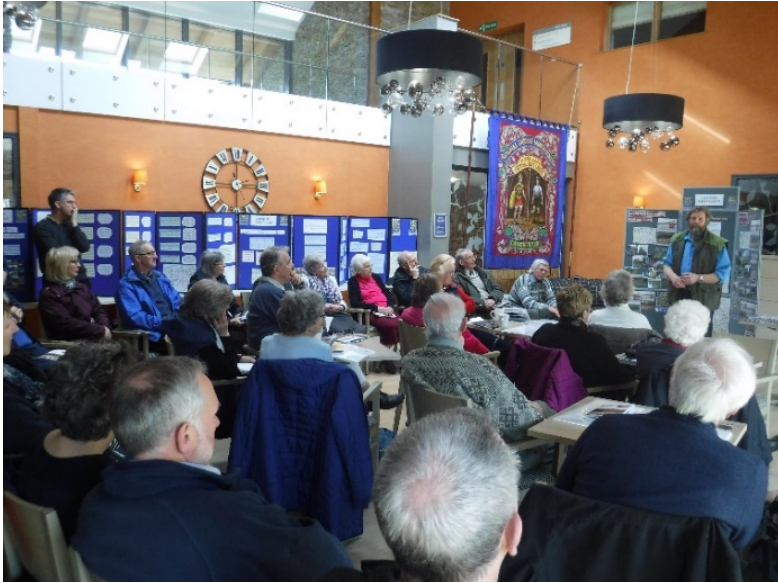
Lynwood House – Lanchester Community Heritage Audit – Launch event

Lanchester Parish council has operated since 1895 to the present day. It has an office in Lynwood House and provides a wide range of services and facilities to the modern parish.