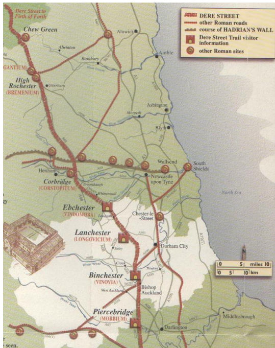
Map of Dere Street

In addition to the fort and civil settlement, Dere Street, the main Roman road linking York and Hadrian's Wall, ran through the landscape and infrastructure relating to the water supply for the fort and civilian settlement still survives in places.