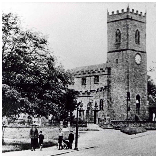
All Saints Parish Church

Life in the later medieval period, from the 11th to the 15th centuries, left more traces in archival material, on the landscape and in a small number of surviving buildings. Woodland was cleared for agriculture, All Saints Parish Church was constructed in stone, and the present village was established around the church.