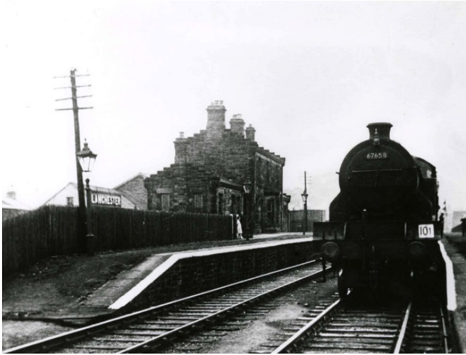
Station House and train