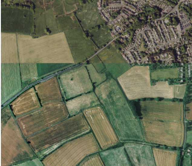
Aerial view of fort

With the arrival of Roman rule in Britain, Lanchester became a hive of activity with the establishment of a fort known as Longovicium and a substantial associated civil settlement and cemetery.