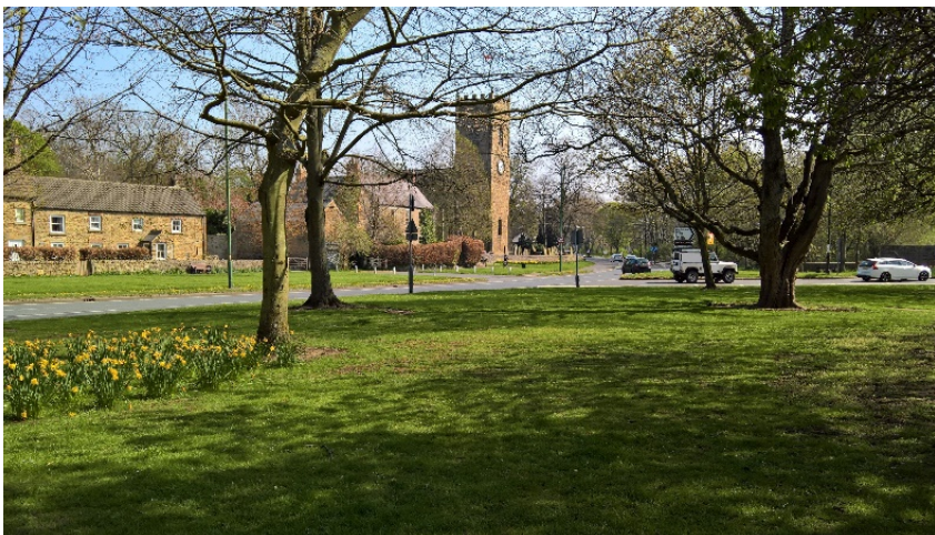
Parish Church and Village Green

The church is seen from many points throughout the village.