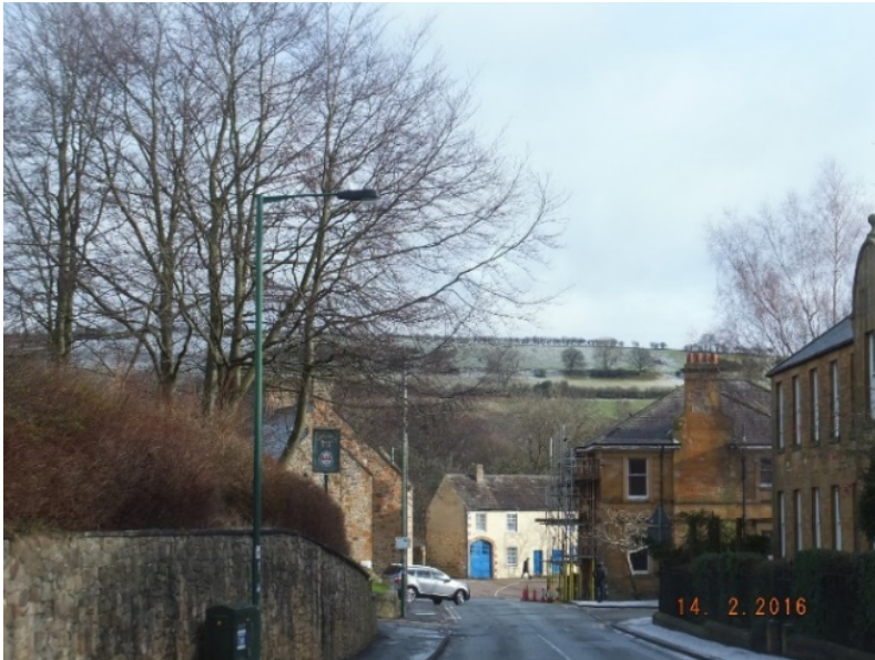
View towards Burnhope

Lanchester Parish is located in County Durham, in the former district of Derwentside. It is centred 8 miles to the west of the city of Durham and 5 miles south east of Consett. The parish covering 4,052,093 hectares, extends from Burnhopeside Hall in the east to beyond the A68 in the west, from Spring Gardens in the north almost to Quebec in the south. Within the Parish there are also small hamlets including Malton, Hurbuck, Hollinside and Ornsby Hill.