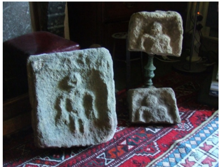
Examples of Roman artefacts

In addition to the fort and civil settlement, Dere Street, the main Roman road linking York and Hadrian's Wall, ran through the landscape and infrastructure relating to the water supply for the fort and civilian settlement still survives in places.