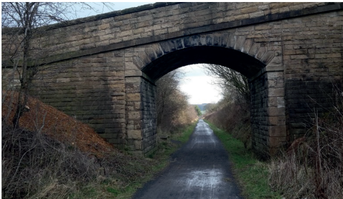
Lanchester Valley Walk

The Lanchester Valley Walk which uses the route of the disused Durham to Consett Railway passes through the village and is a wonderful amenity for walkers, cyclists and riders. It provides the outlying settlements of Malton and Hurbeck with a safe off-road route into Lanchester village. It is part of the National Cycle Route and brings trade into the village.