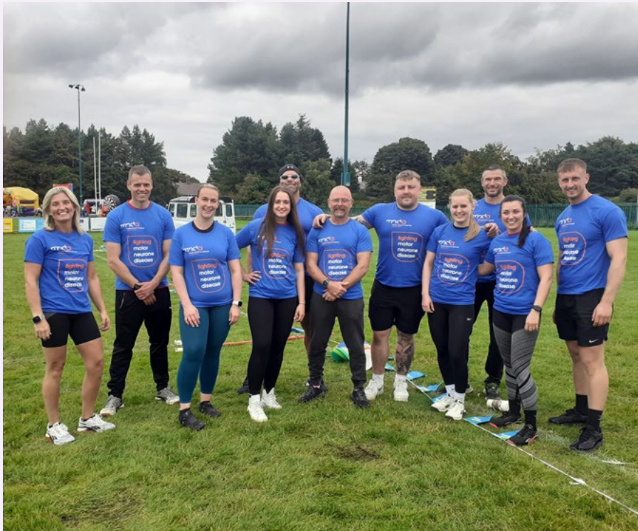
Competition winners at Benfieldside, Blackhill, Bridgehill and Shotley Bridge Family Fun Day