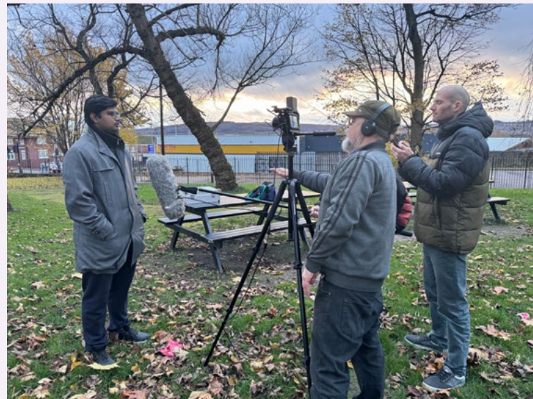
Digital Voice for Communities

The project will work in partnership with voluntary groups, engage in research to ensure a range of different activities and groups are represented, and will find good news stories that show the impact through their positive messages of wellbeing as a result of taking part in the groups.