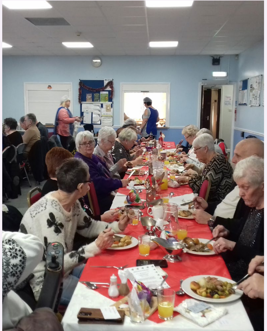
Delves Lane Lunch Club, Christmas Lunch