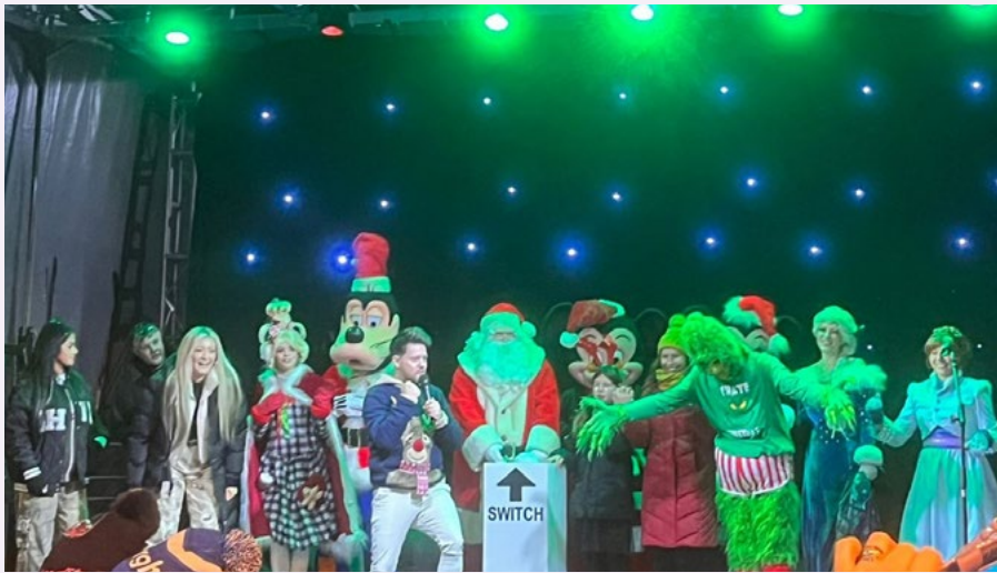
Christmas in Consett