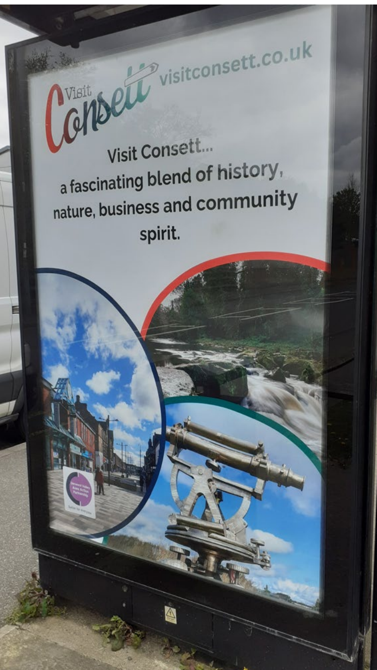
Visit Consett website publicity in a local bus shelter