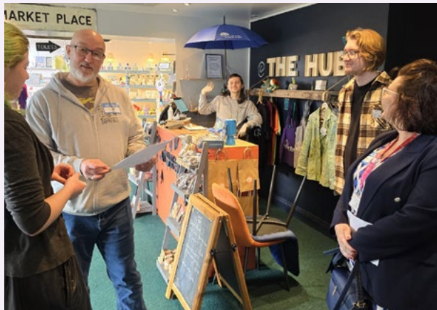
Representatives from Durham Enable visit Celebrate Difference to get the project underway