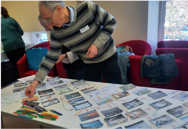
Climate Action Workshop