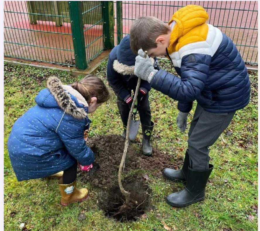
Children from Bishop Ian Ramsey School tree planting

OASES (Outdoor and Sustainability Education Specialists), Derwent Valley Climate Friendly Schools, £6,661 (full project amount is £36,982 with the majority of funding provided in 2022/23)