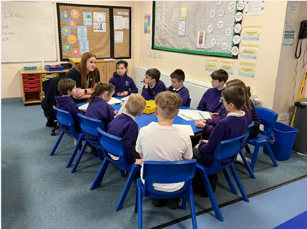
Children from Bishop Ian Ramsey School session planning