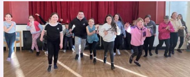
Here we come! Drama Day with Mad Alice Theatre Company

The children and young people were able to socialise in a different environment and learn something new which helped improve their confidence and mental and physical wellbeing.