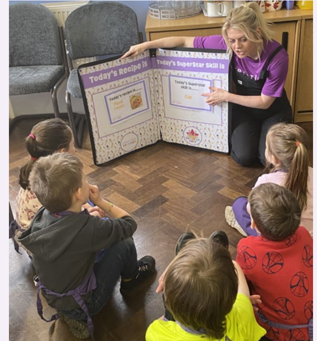
Learning about making healthy pizzas at Glenroyd House