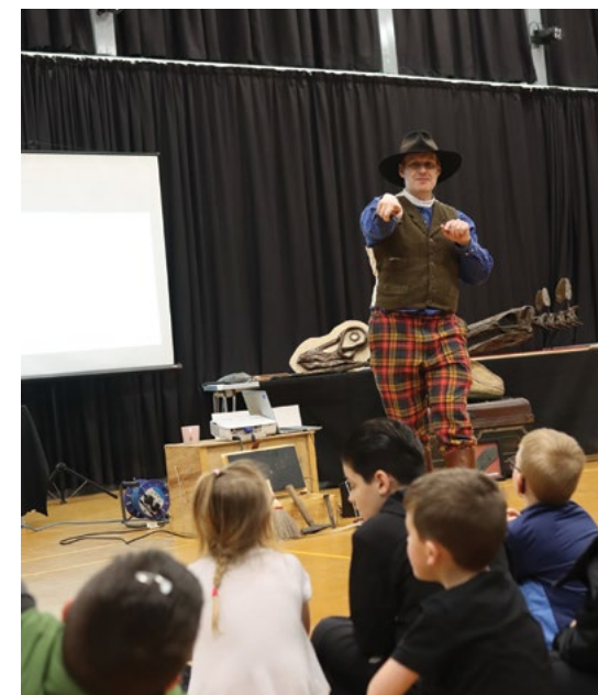
Learning a new way CIC – Outdoor adventures