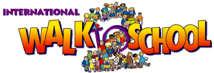
American Walk to School logo