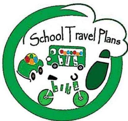
Norfolk County Council School Travel Plan logo