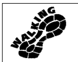
A partial logo, which could be used in a walking campaign.