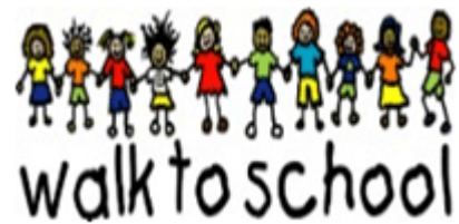
Walk to School – this logo symbolises a project operated by Hope for Children to raise money for poor families to send their children to school in Uganda and the Philippines